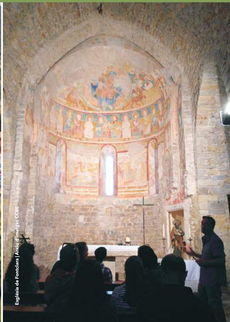
Església de Fontclara