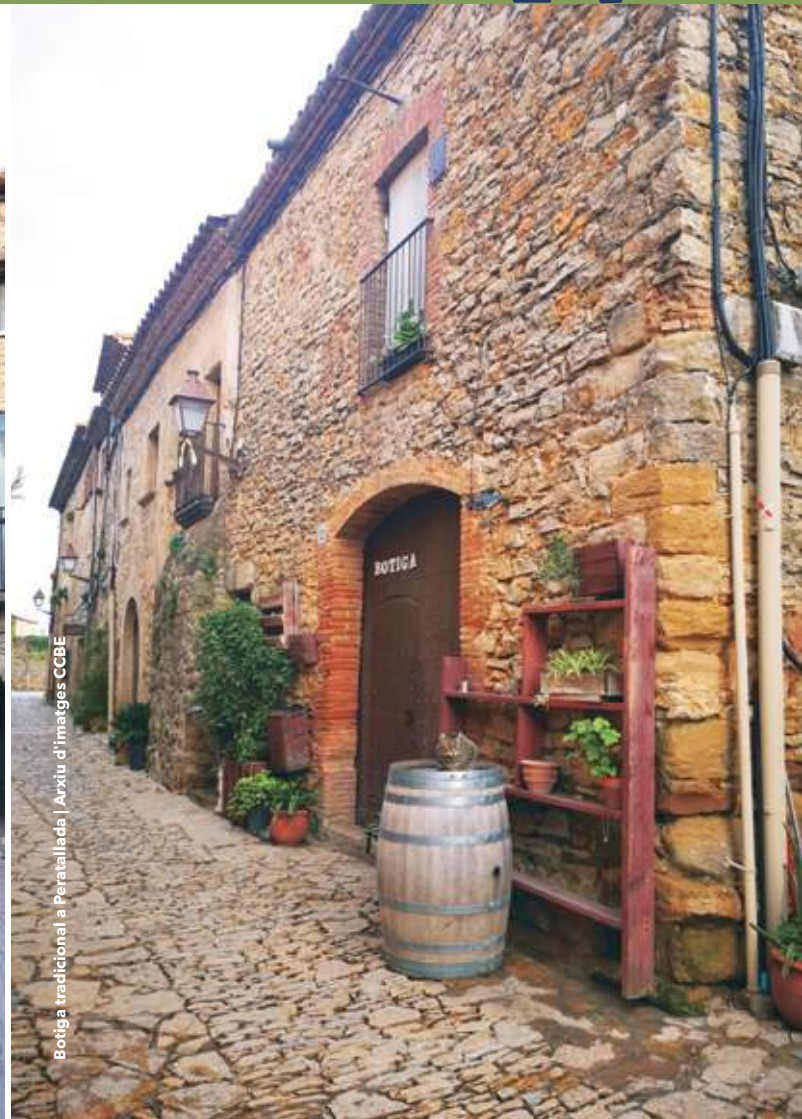
Botiga tradicional a Peratallada