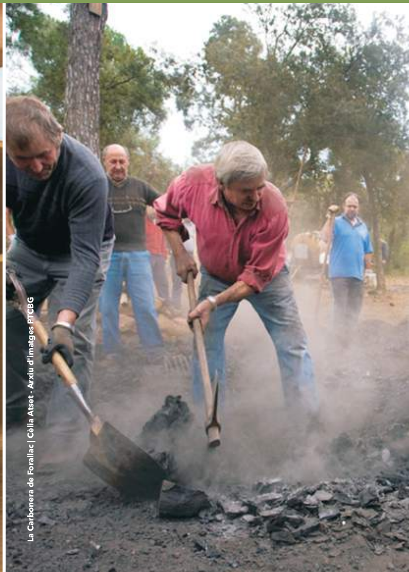
La Carbonera de Forallac