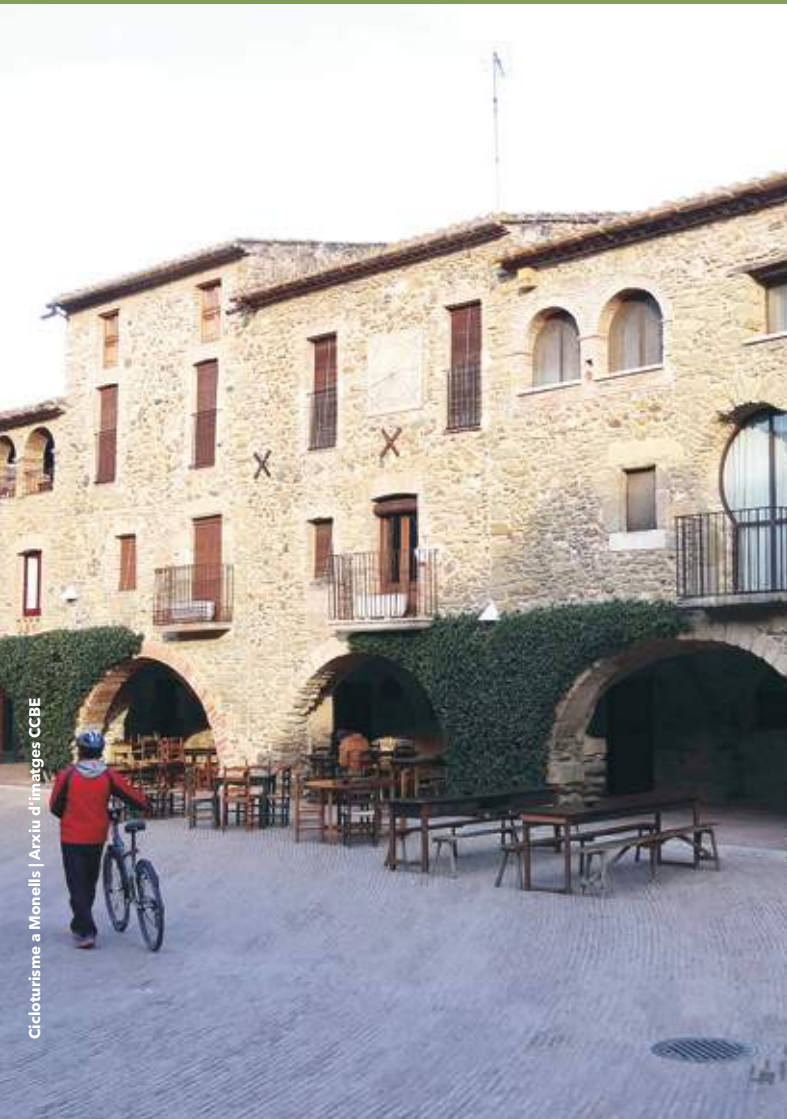
Cicloturisme a Monells