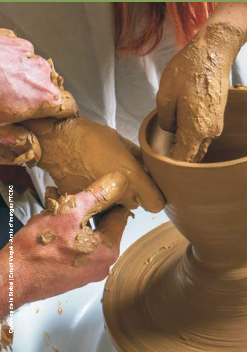
Ceràmica de la Bisbal | Estuèi Vaqué - Arxiu d'imatges PTCBG